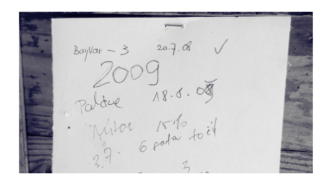
Figure 1: Managing beehive data on paper

The implementation of Pametna čebela will be divided into sub-projects. Those are: core infrastructure , user interface and sensor node .